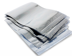
EMI STATIC SHIELDING