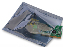
ELECTROSTATIC DISCHARGE (ESD)